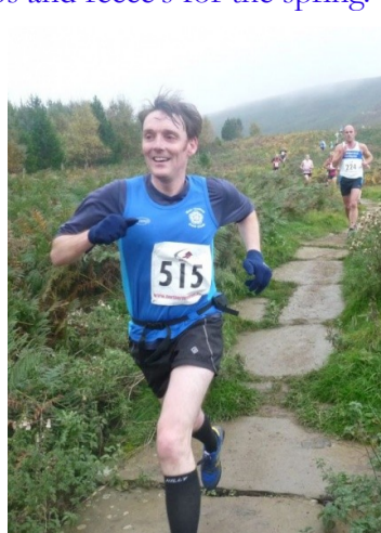
Fell

Danby Beacon, Team champs, Club Champs and recce's for the spring.