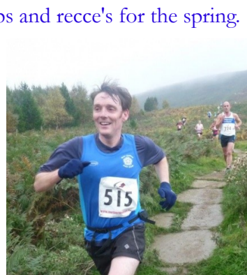
Fell

Danby Beacon, Team champs, Club Champs and recce's for the spring.