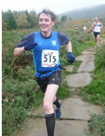
Fell

Festive/New Year Results, Winter Series update and some running/racing ideas for 2012.